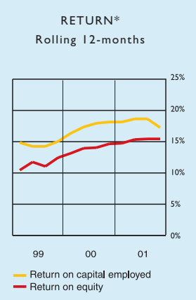
* excl. items affecting comparability 1999 and 2000